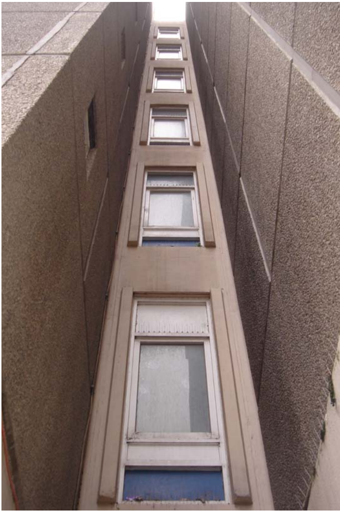
Cleveleys Building, Blackpool and The Fylde College before