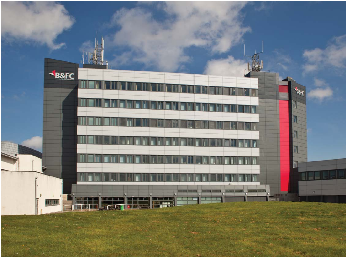
Cleveleys Building, Blackpool and The Fylde College after