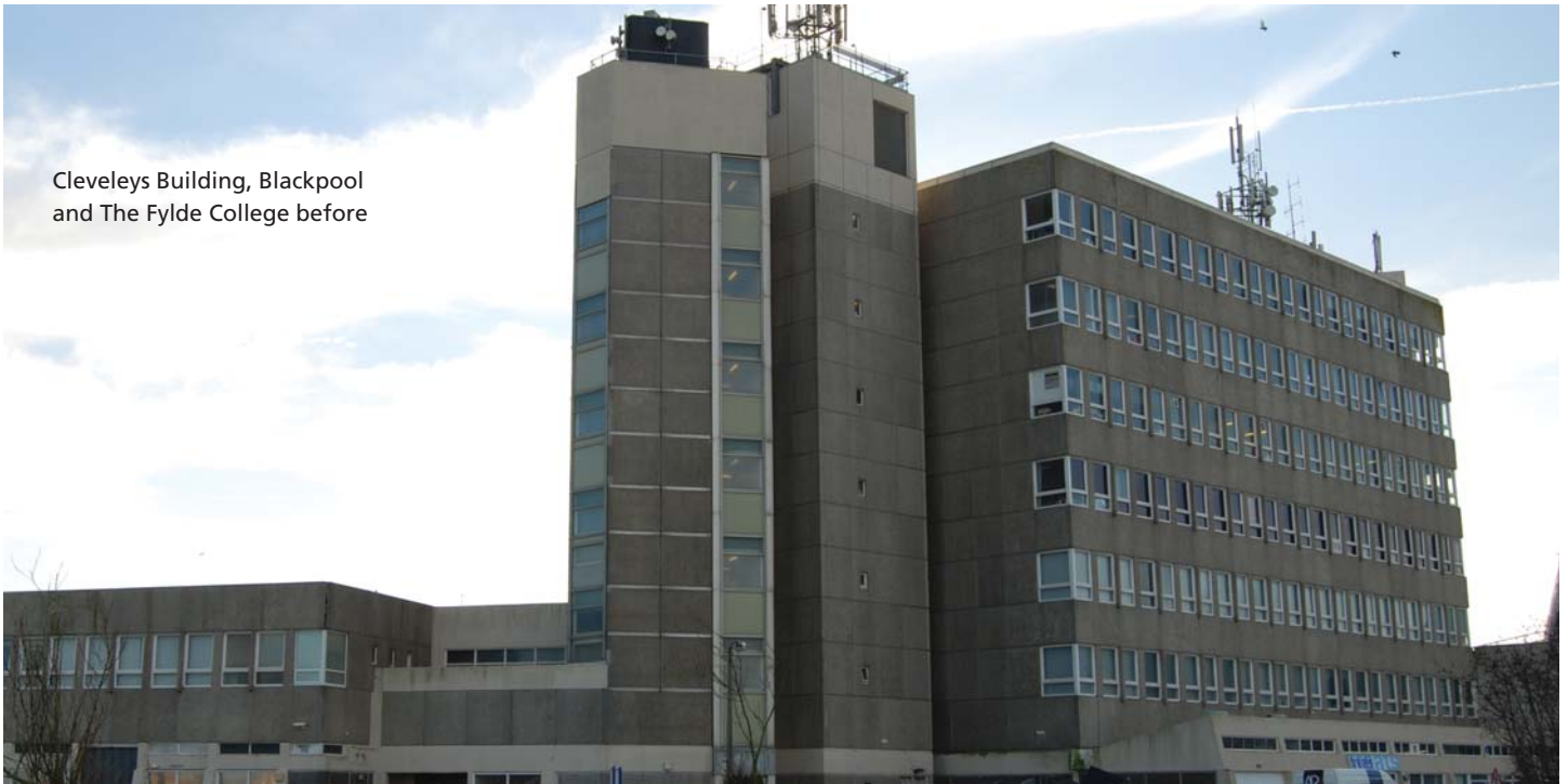
Cleveleys Building, Blackpool and The Fylde College before