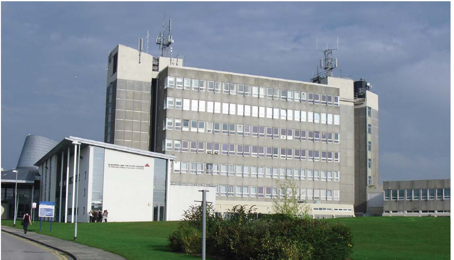
Cleveleys Building, Blackpool and The Fylde College before