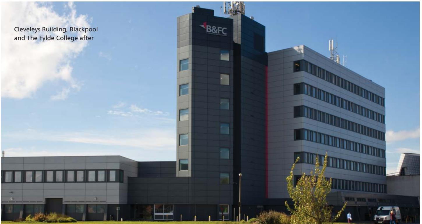
Cleveleys Building, Blackpool and The Fylde College after

The project comprised design and build of an insulated aluminium rainscreen and replacement windows to the seven storey Cleveleys building and adjacent boiler room with local repair, restraint and stabilisation of the existing external fabric. Additional works undertaken included new aluminium glazed screens and doors at ground level and new insulated over-roofing to all roofs.