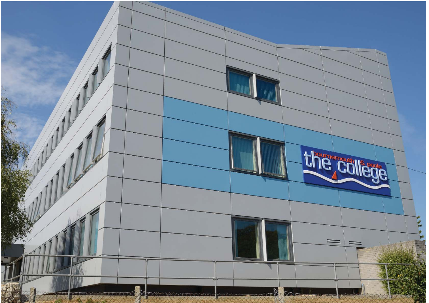
The Bournemouth & Poole College, North Road Campus