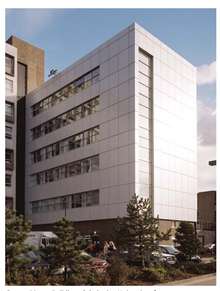
George Moore Building Caledonian University after