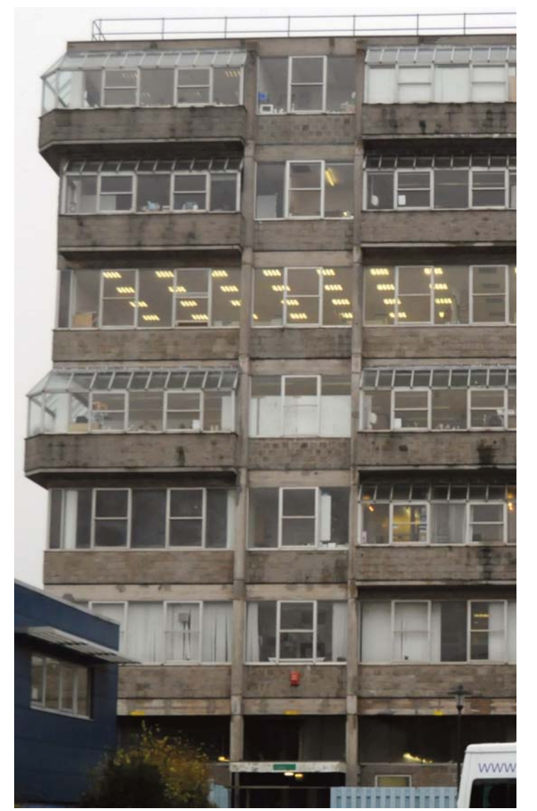
Tamar Building, Cornwall College after