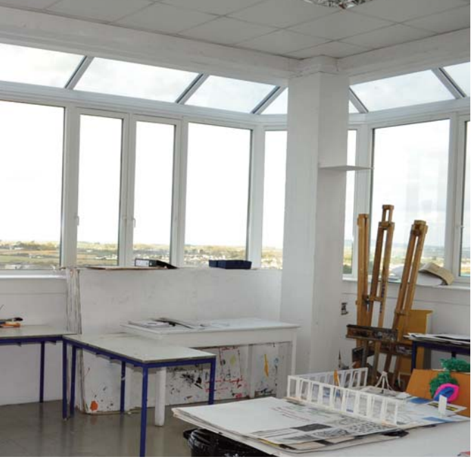
Tamar Building, Cornwall College before