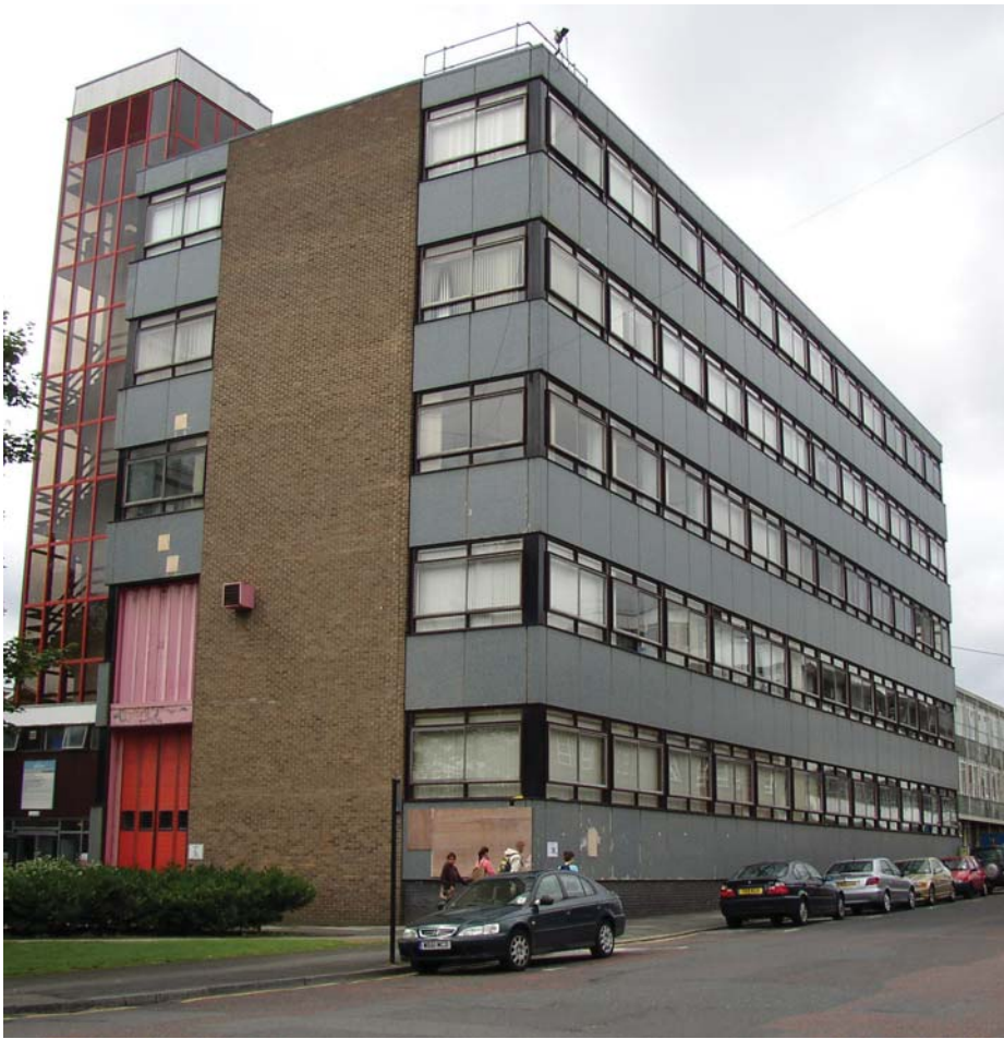
Northumbria University before