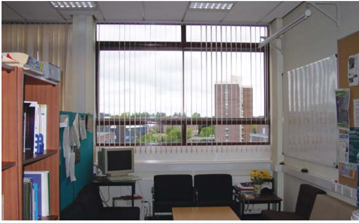
Northumbria University before