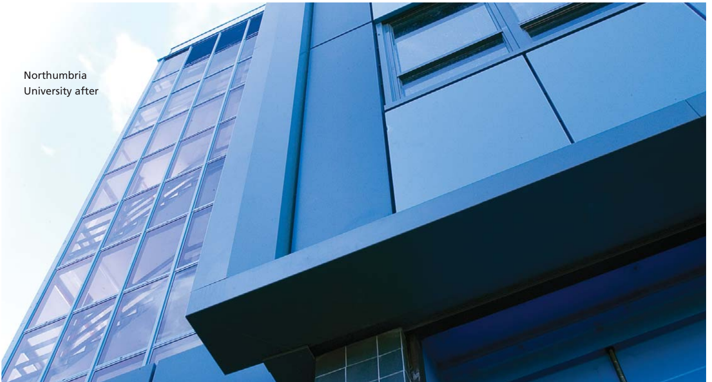
Northumbria University after