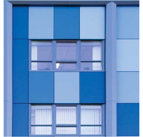
Northumbria University after