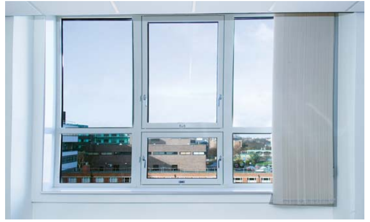
Northumbria University after