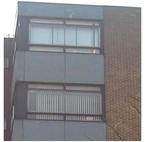
Northumbria University before