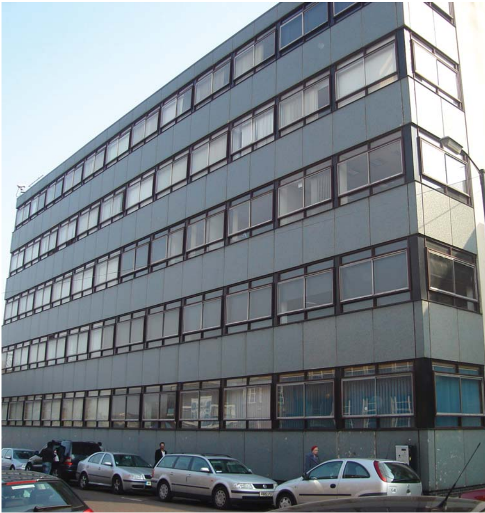
Northumbria University before