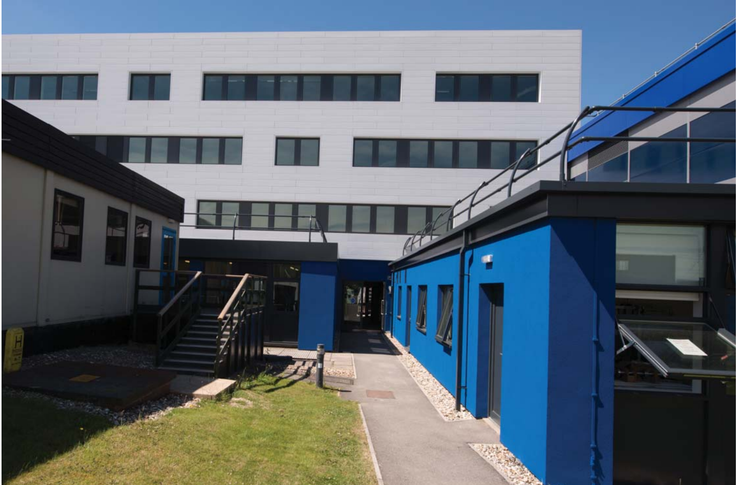
R1 Building, STFC Rutherford Appleton Laboratory