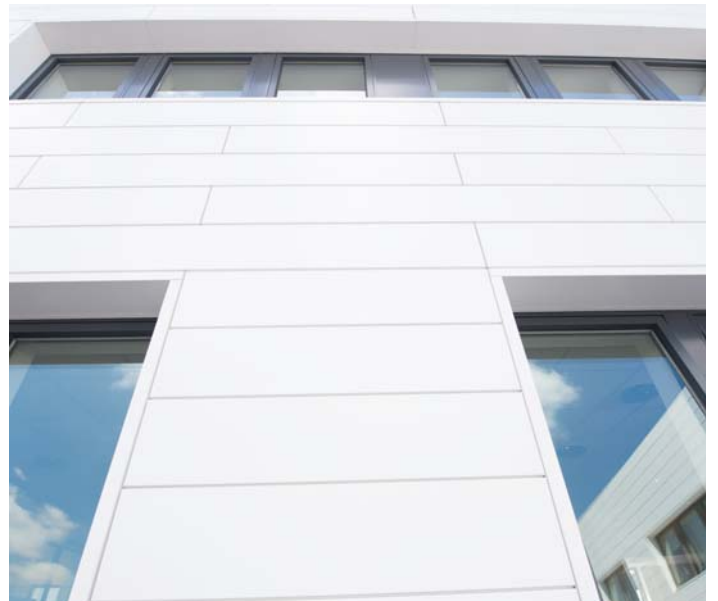
R1 Building, STFC Rutherford Appleton Laboratory