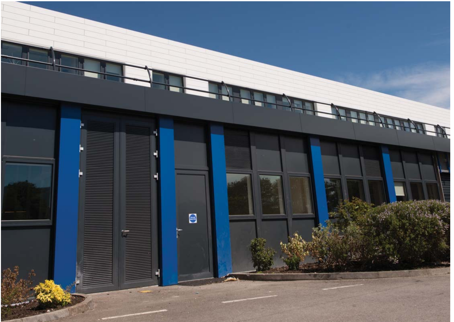
R1 Building, STFC Rutherford Appleton Laboratory