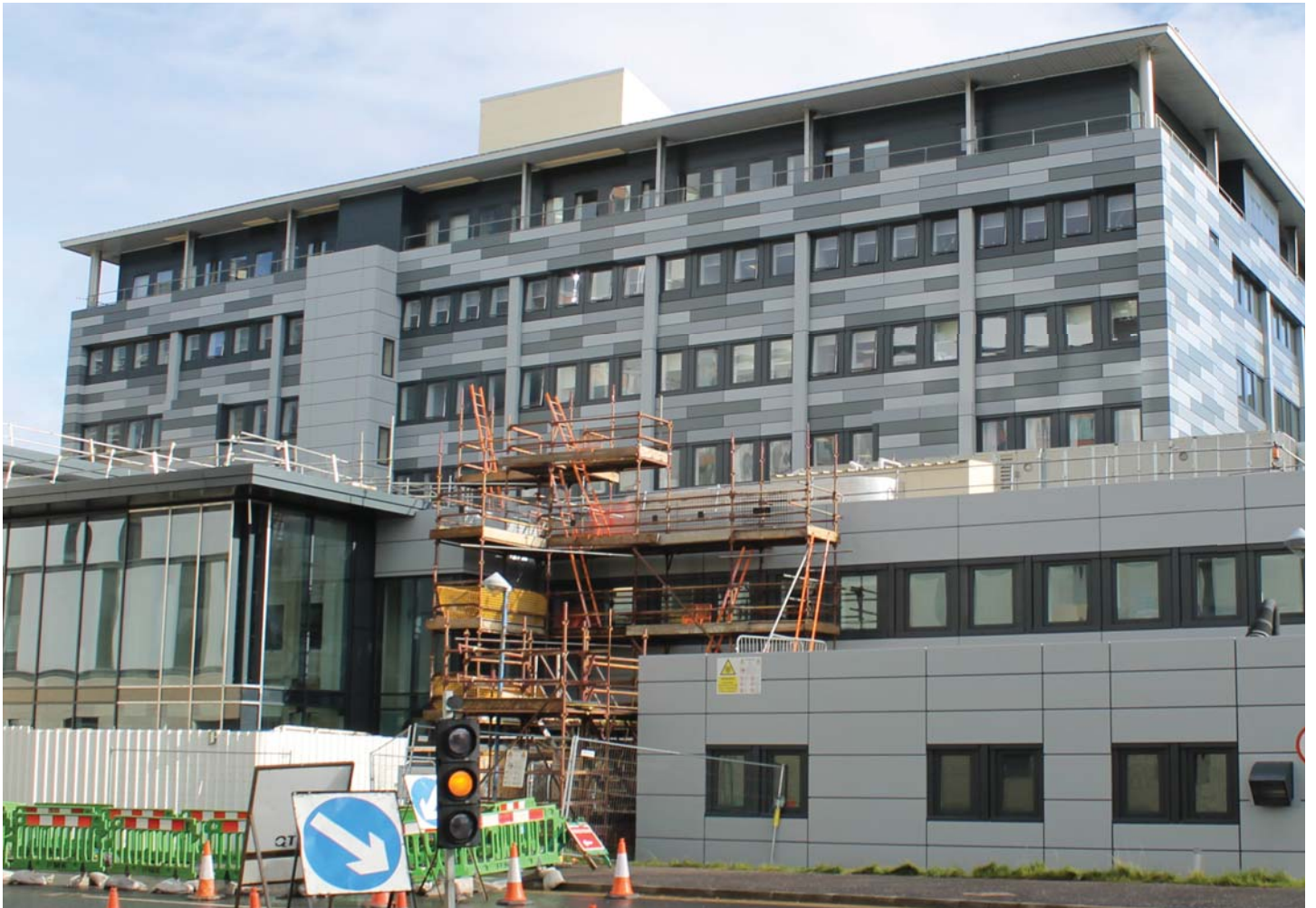
Neurosurgical Block, Southern General Hospital NHS Greater Glasgow and Clyde