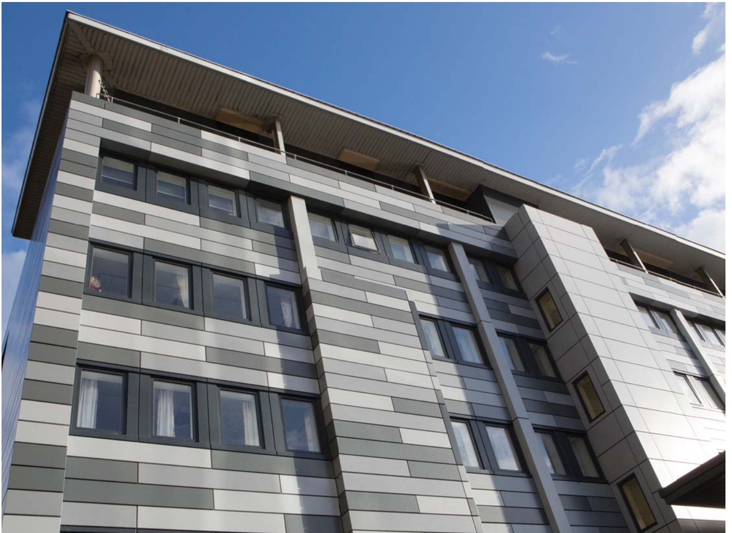
Neurosurgical Block, Southern General Hospital NHS Greater Glasgow and Clyde