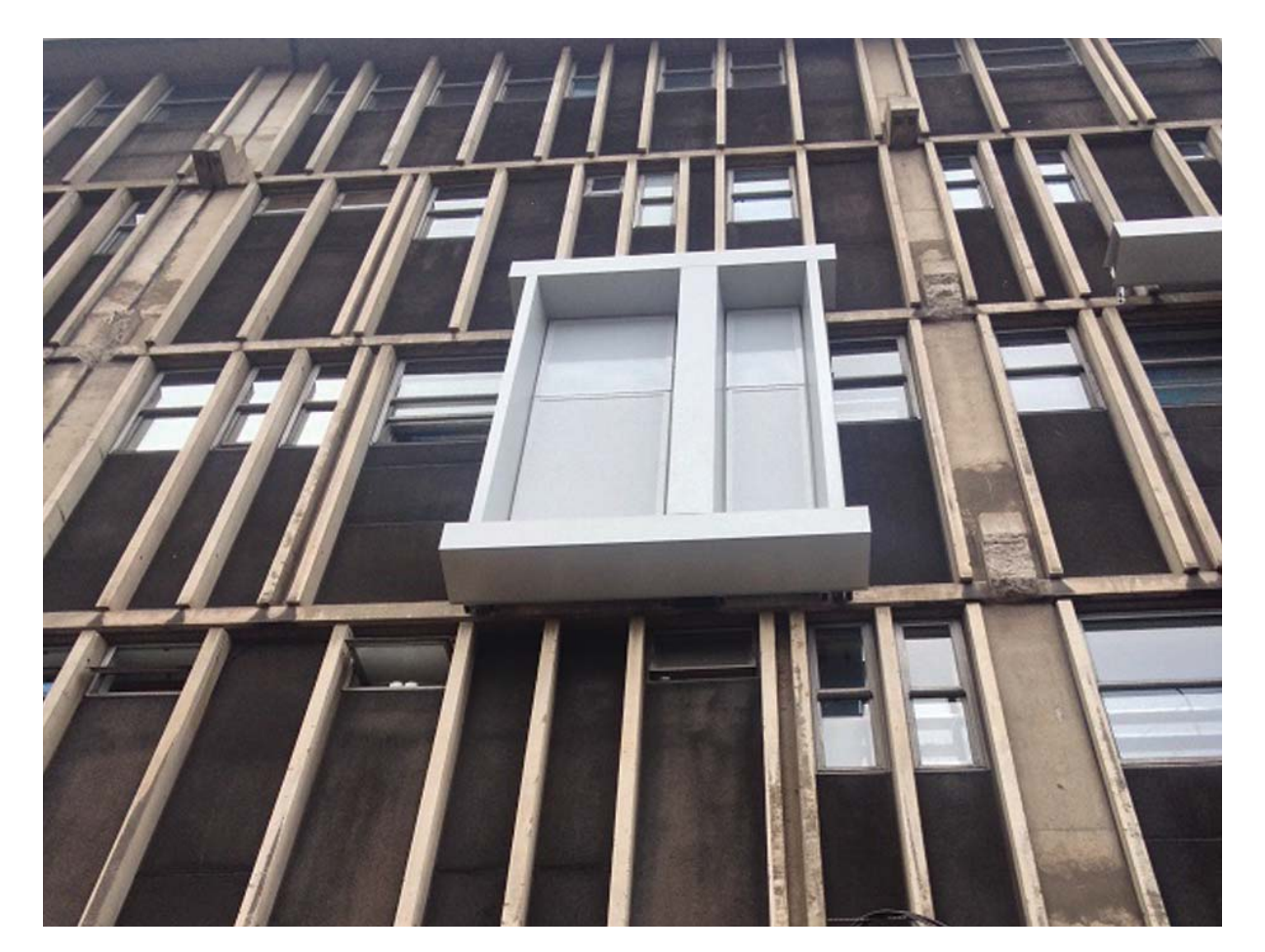
Mock-up installed on the building.