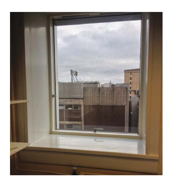
The final solution met the architectural intent that "Veil" should have no visible windows whilst meeting the performance requirement of transmittance of light internally.