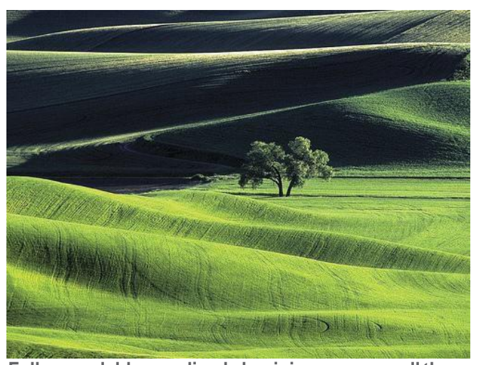
Fully recyclable, anodised aluminium answers all the environmental imperatives of today and tomorrow

Anodised aluminium is unique, comprising only pure aluminium, its alloying elements and oxygen. As pure aluminium, it is fully recyclable without intervening chemical processes and emissions. Because of this and the ready market for quality aluminium scrap, the anodised aluminium will have a cash value to offset the cost of demolition at the end of the useful life of the building.