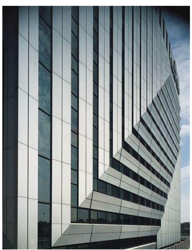
Anodised aluminium can be used to create modern and advanced designs – here on a landmark building in Paris-La-Défense constructed over 25 years ago

However, this natural oxide layer of aluminium is thin, irregular and unstructured with only superficial corrosion protection. Anodising creates a thick, perfectly formed and scientifically controlled oxide layer, which ensures a surface of unparalleled corrosion resistance and locks in the pure and natural metallic aspect of the metal. Anodising has been used for external building applications for over 60 years. With an appropriate anodic layer thickness for external use, anodised aluminium will perform without problem, even in the most severe environments. In particular, anodised finishes are highly durable in city and marine environments, due to their resistance to chlorides and sulphates.