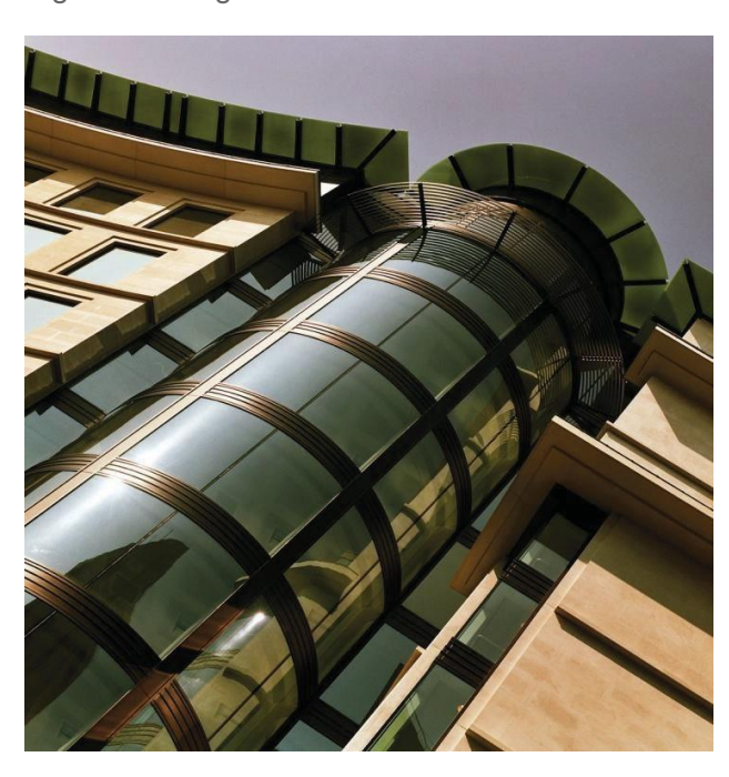
Building exteriors blend different materials with anodised aluminium without problems

Anodising avoids the risk of localised high coating thickness or orange peel effect, typically associated with organic coatings on such surfaces.