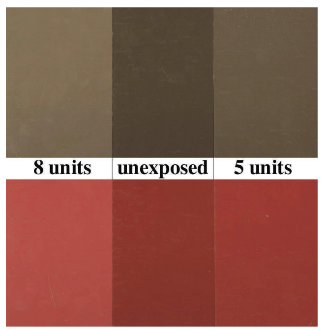
Accelerated tests to replicate fading on non-anodised surfaces

finishes. Organic coatings are always subject to fading in varying degrees over the lifetime of a building.