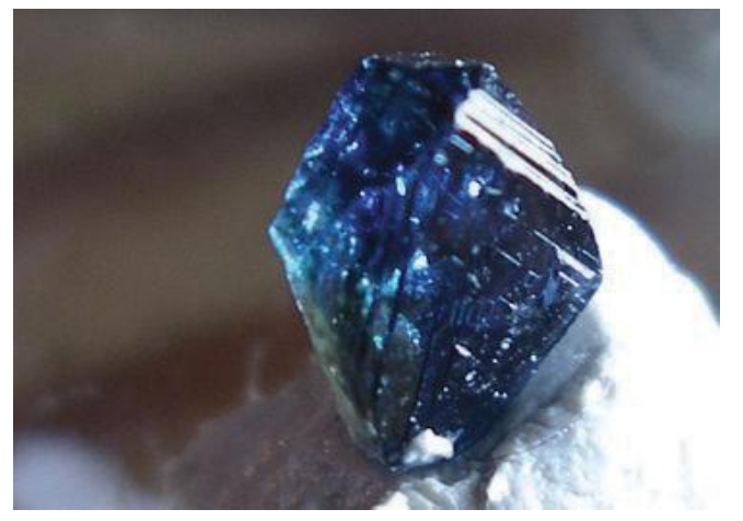
Anodised surfaces are very hard –80% of the hardness of diamond

Aluminium oxide is a very hard compound which is second only to diamond, on the Mohs scale of mineral hardness. Anodised aluminium surfaces offer, therefore, superior scratch and abrasion resistance than coated surfaces.