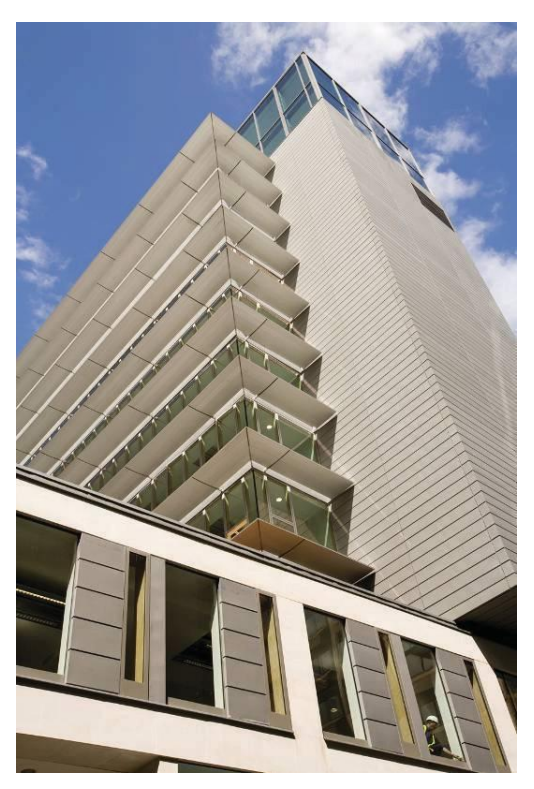
Contemporary building with anodised aluminium façade

Anodising enhances the natural qualities of aluminium still further; it permits a strongly contemporary finish with incomparable corrosion and abrasion resistance. Unique amongst surface treatments, such as coatings, anodising is totally integrated with the metallic substrate – it is not simply a film applied to cover the surface. The result – pure aluminium – is a perfectly and repeatedly recyclable material with remarkable performance characteristics.