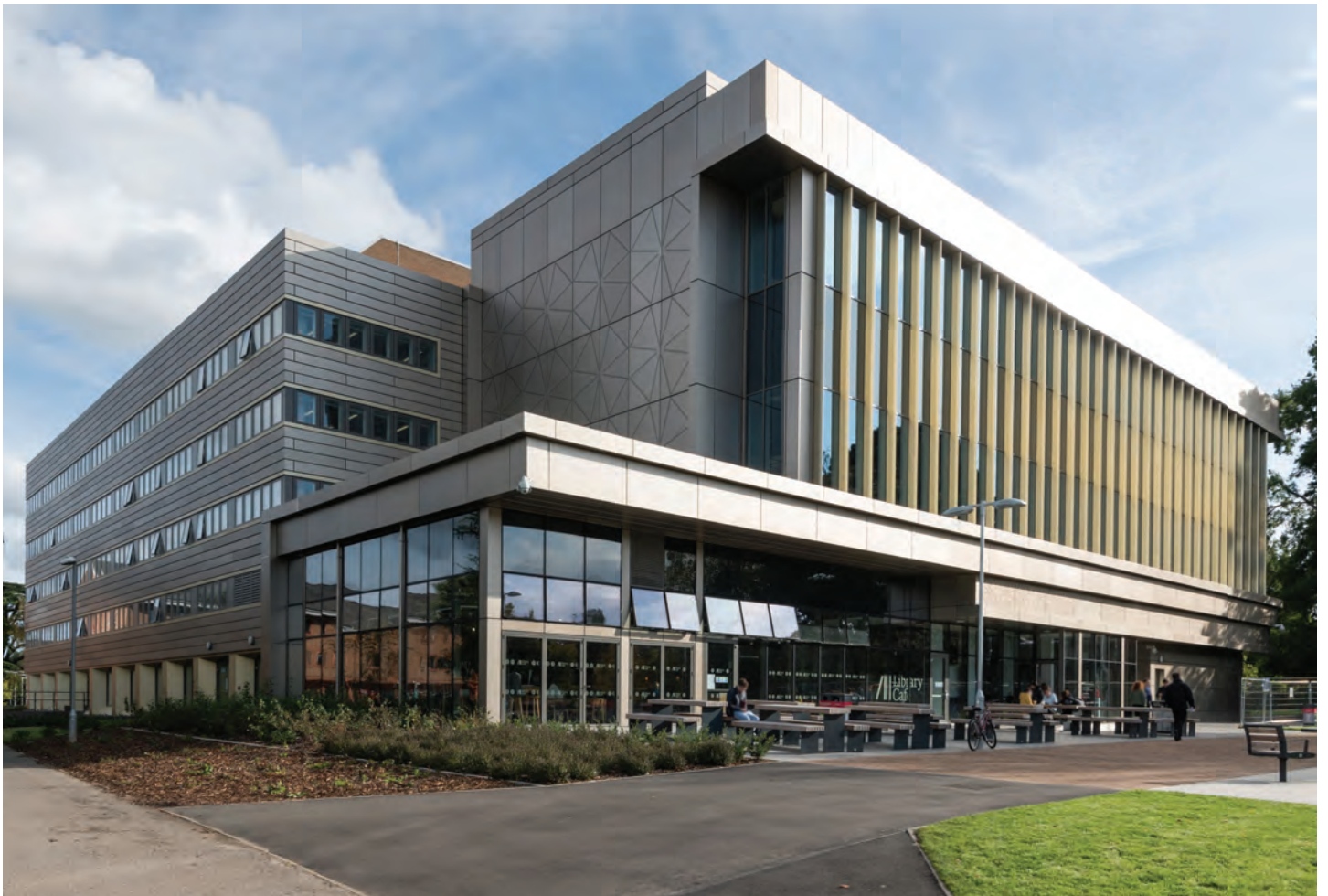
The Library Building, University of Reading, White Knight Campus