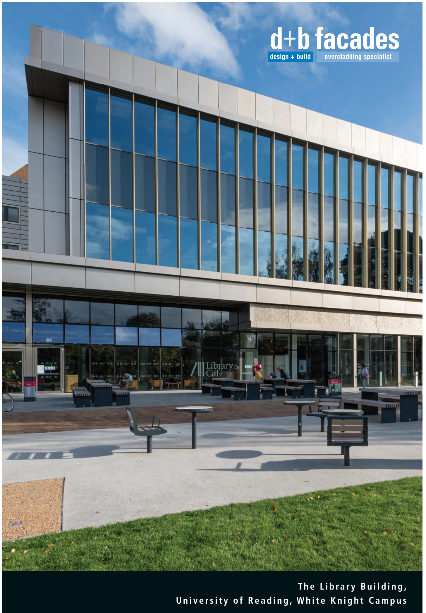
The Library Building, University of Reading, White Knight Campus