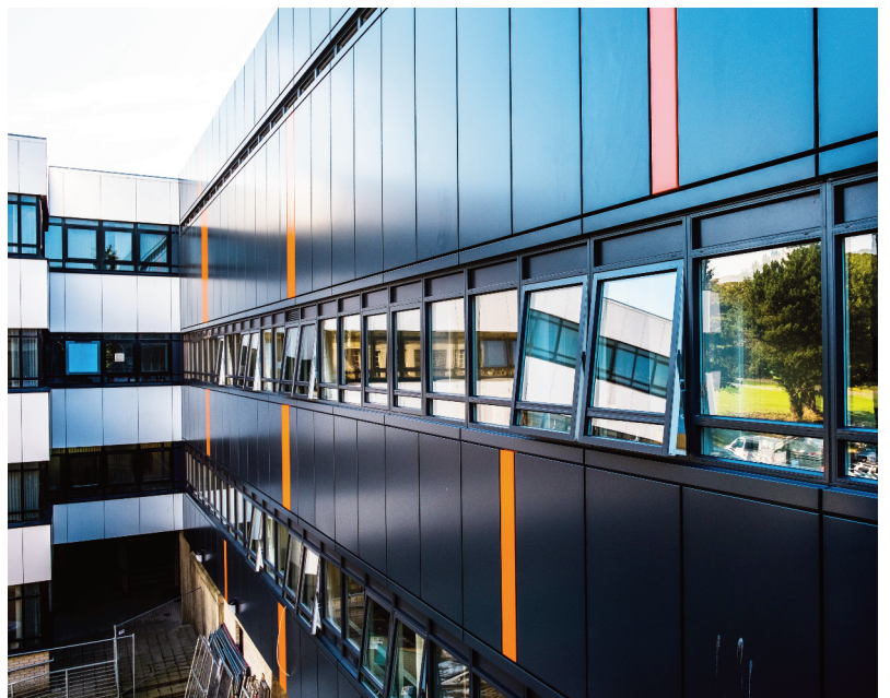
Aberystwyth University, Cledwyn Bridge Building