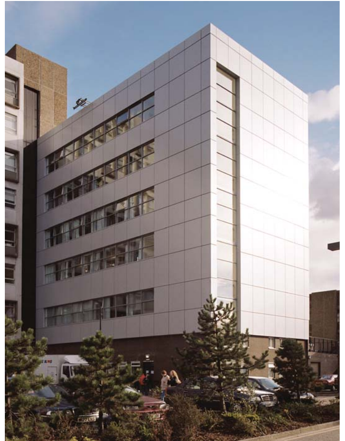
George Moore Building Caledonian University after