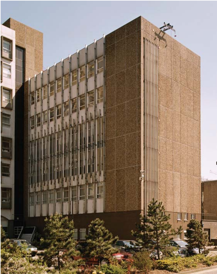
George Moore Building Caledonian University before