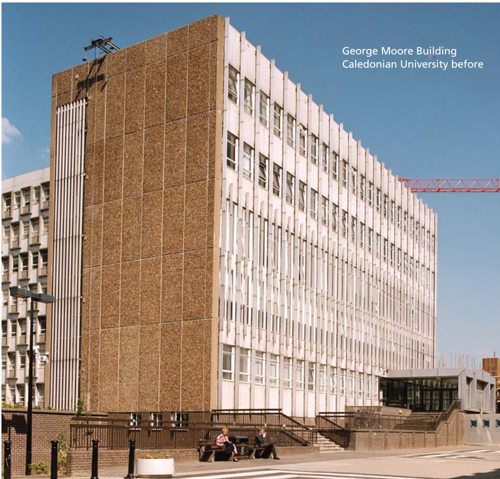
George Moore Building Caledonian University before