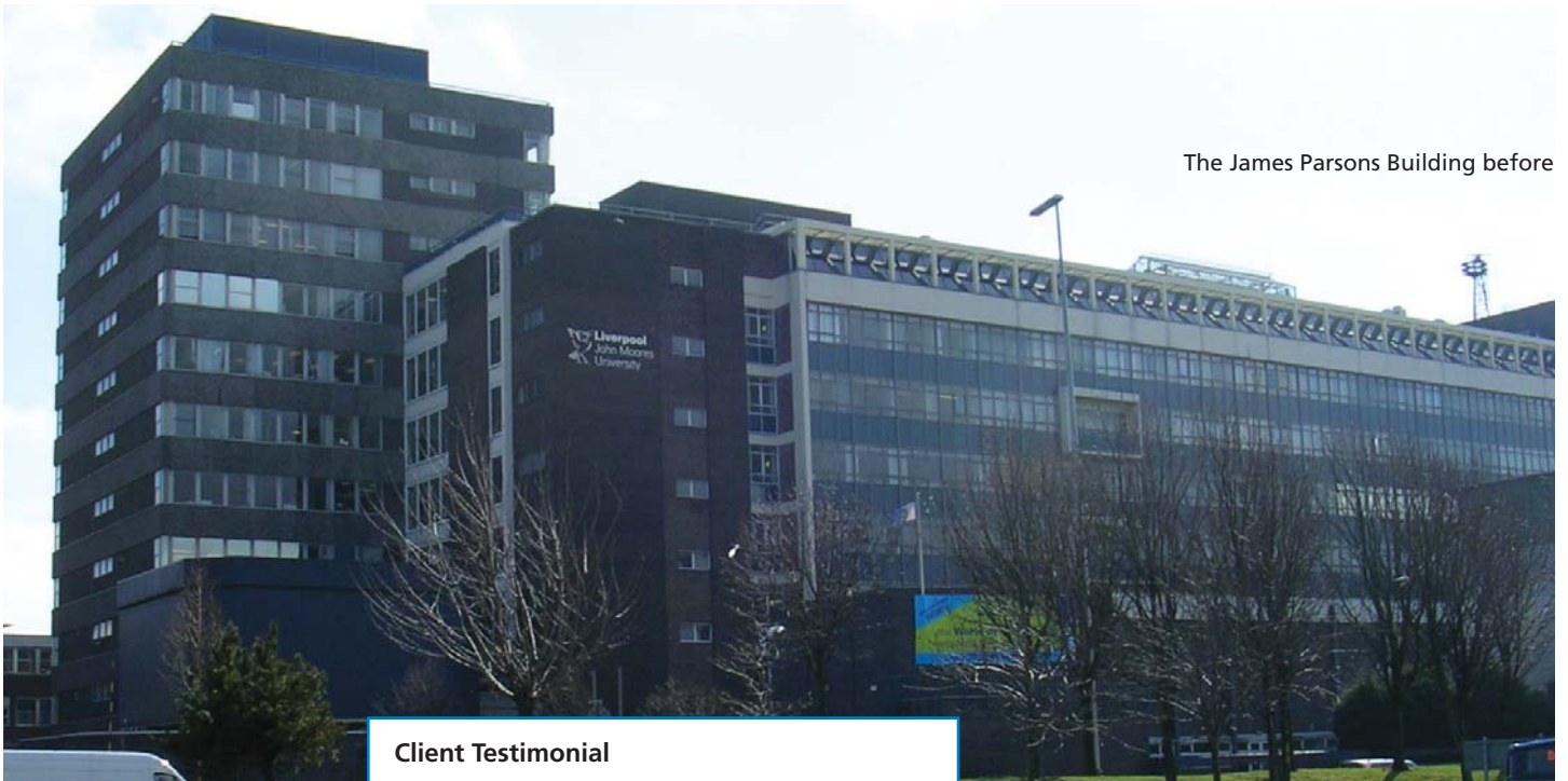
The James Parsons Building before