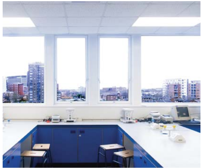
The James Parsons Building after