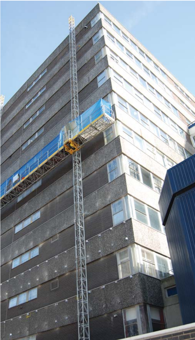
The James Parsons Building after