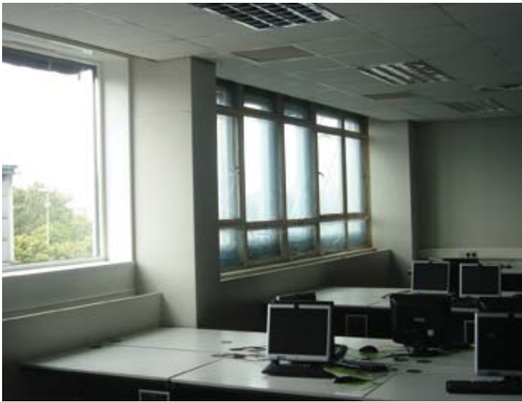
The James Parsons Building before