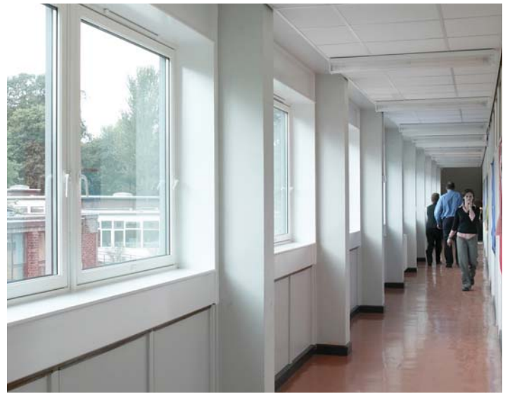
Marple Hall School after