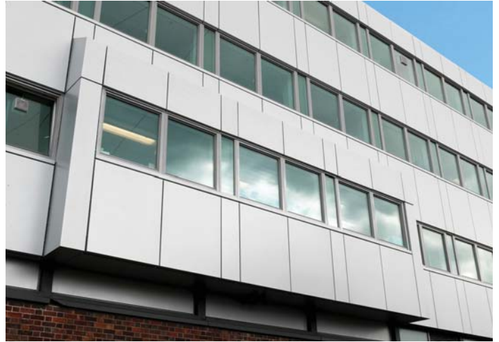
Marple Hall School after