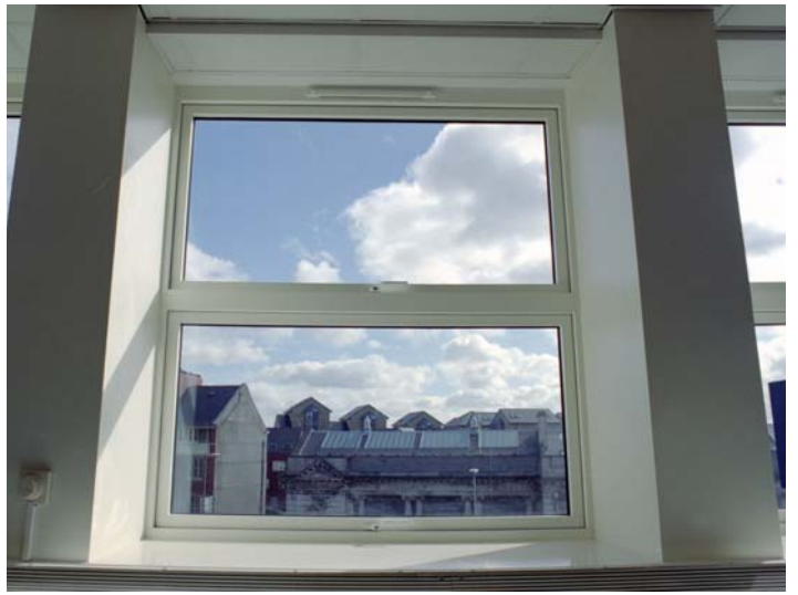
Marple Hall School after