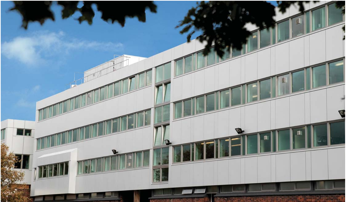
Marple Hall School after

The project comprised design and build of an insulated aluminium rainscreen and replacement windows. Additional works undertaken included concrete repair prior to overcladding and curtain walling to the principle staircase.