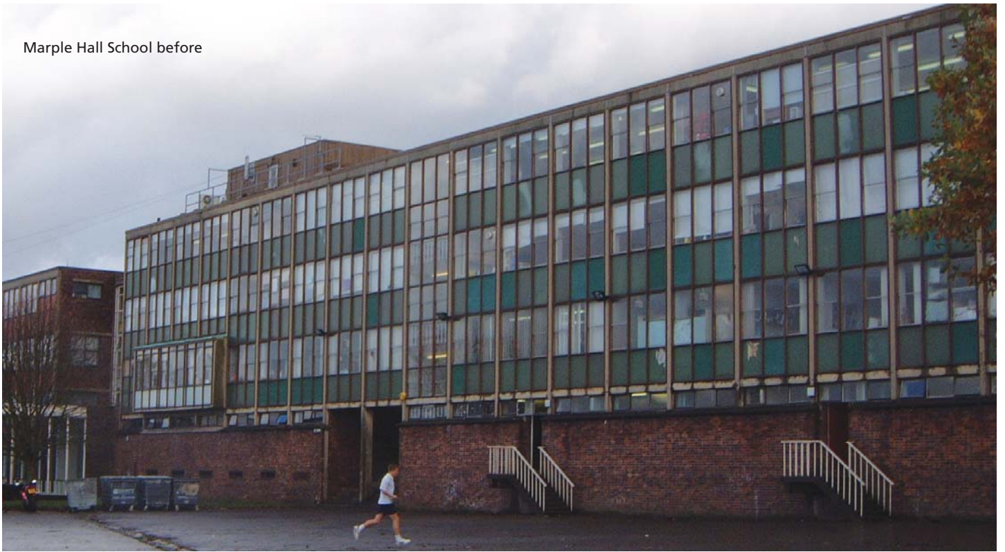
Marple Hall School before