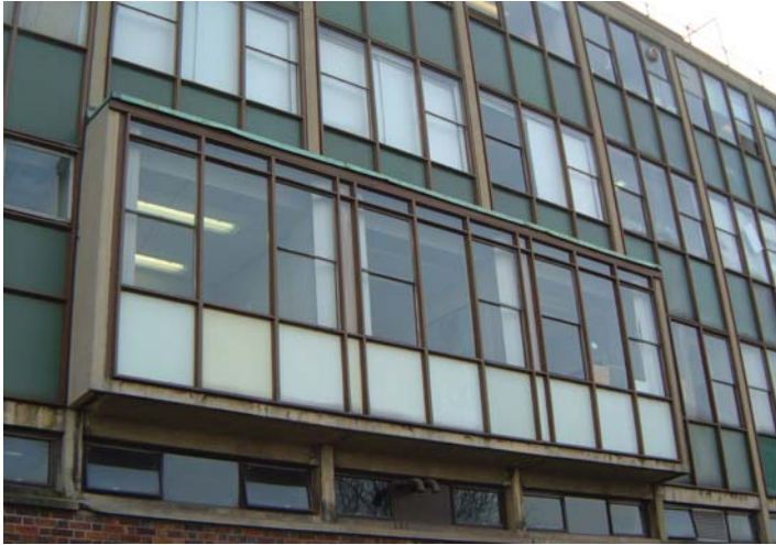
Marple Hall School before