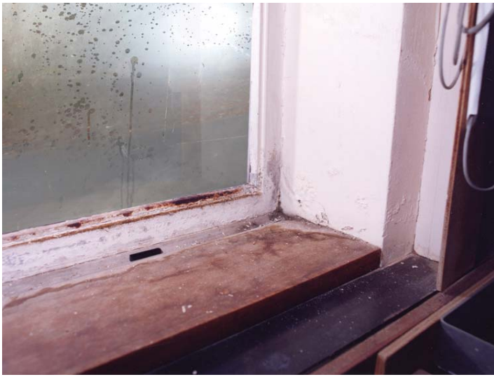
Marple Hall School before