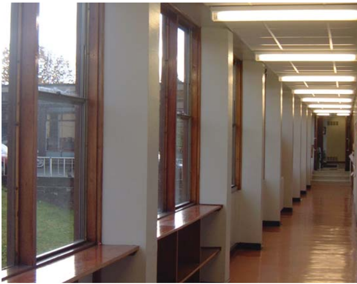
Marple Hall School before