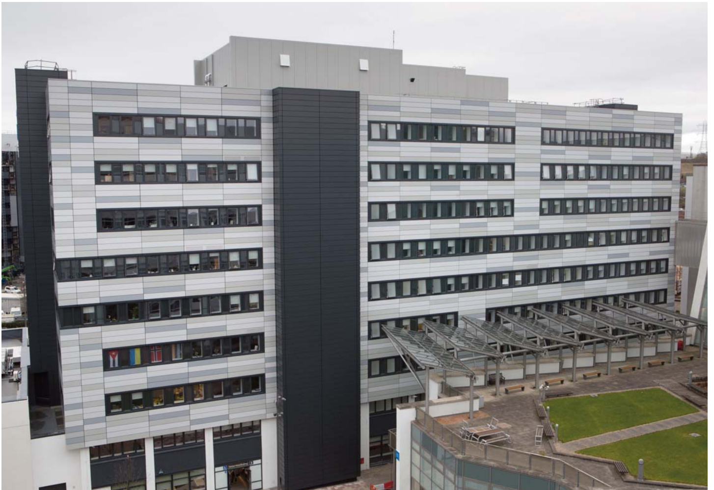
Hamish Wood Building, Glasgow Caledonian University