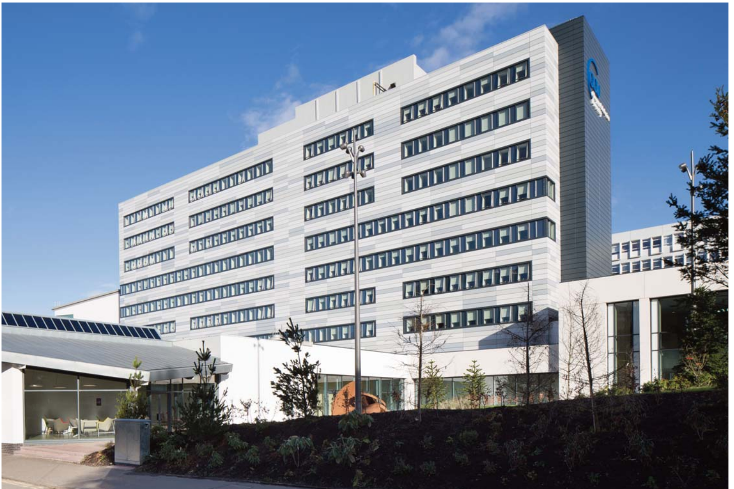
Hamish Wood Building, Glasgow Caledonian University