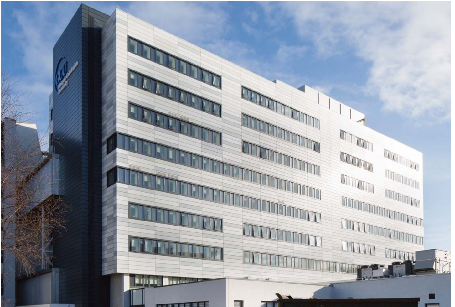
Hamish Wood Building, Glasgow Caledonian University